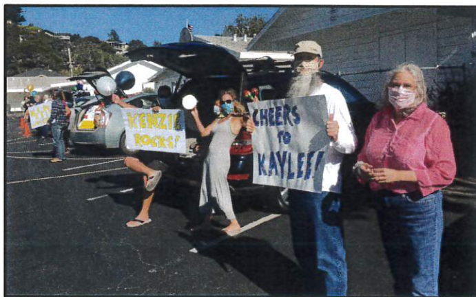
Celebrating 2020 Soquel Grads with a drive through parade!